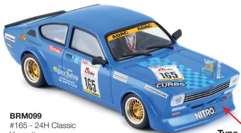
BRM099 #165 - 24H Classic Youngtimer Nurburgring 2018