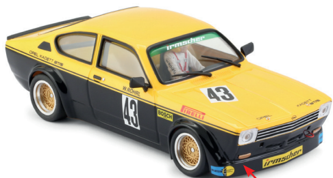
BRM100 #43 - Walter Rohrl DRM 1976