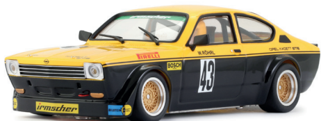
Type A body Spoiler